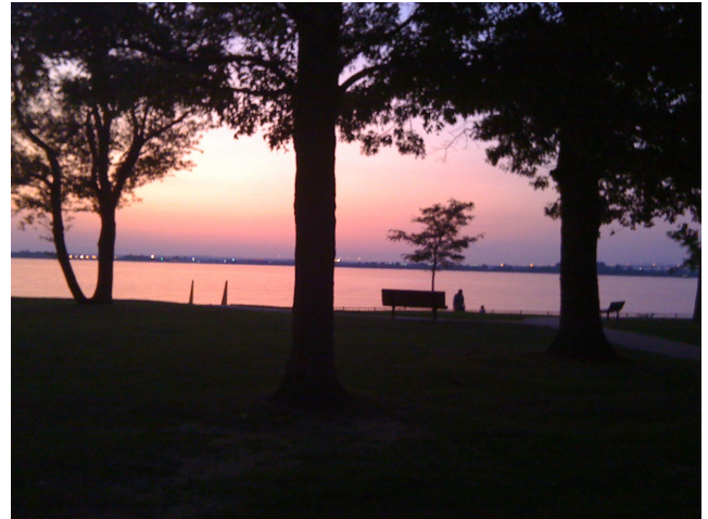
Sunset on the banks of the Delaware River