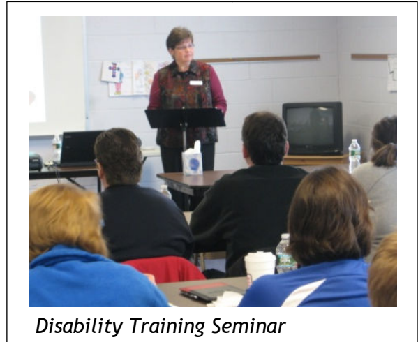
Disability Training Seminar

I'm looking forward to attending the Accessibility Summit at McLean Bible Church near Washington, DC the weekend of April 20 th . This is a time for me to be a seminar participant and student. I'm looking forward to this time of learning and gathering of resources so I can share what I've learned with those I train in future seminars.