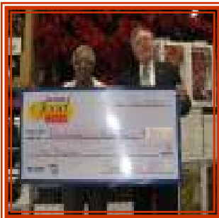
Accepting a donation from Sam's Club

As Director of Development for HVMi part of my job consists of applying for grants from foundations and organizations throughout the year. In 2008 we were blessed in many ways as we received grants from foundations such as Sam's Club/WalMart, ShopRite, Staples and others. In addition, this year we sponsored fundraisers through Pizza Hut Restaurants in the Lancaster area, placed coin banks in willing locations to receive funds for Handi*Camp as well as sponsored a night at the Camden Riversharks Baseball Park. We were pleased to have a group of over 200 people attend and plan to sponsor another Riversharks game, as well as a Lancaster Barnstormers game, in 2009.