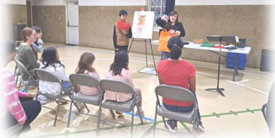
Continued Bible clubs—Jan thru April