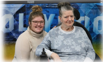
Bible Conference Retreat—March 22-24, 2024