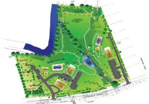
—follow along at hvmi.org/property-updates