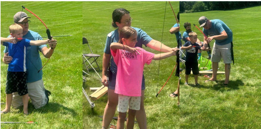
Fun times at Handi*Camp for the kids!

Some of the fun adventures we’ve had as a family lately include: