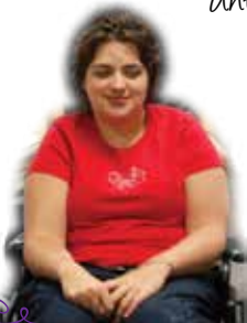
By Nikki Stout, Bible Conference 2 Guest

Let the love of Jesus dwarf the distance between you Until another summer rolls around.