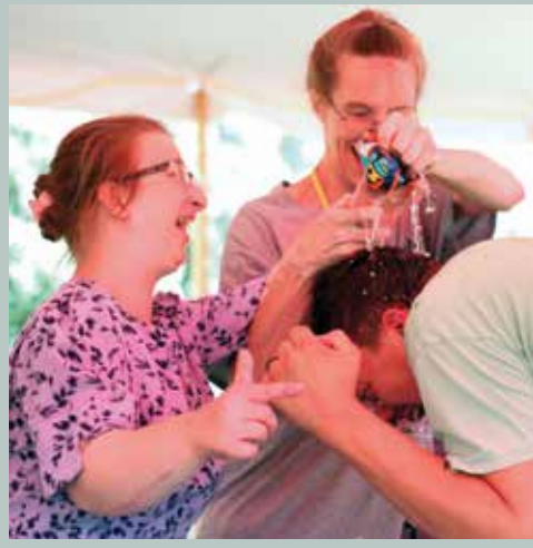
Cooling off with Water Games