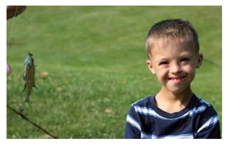
Handi*Camp Day Camp over the previous five weeks. What a great way to end our summer program—thanking the Lord for all HE did in the lives of precious people through this ministry.

Wednesday, July 7, was our final day of camp. We had invited all who helped make Handi*Camp Day Camp a great success to join us at Yoder's Restaurant in New Holland for a time to celebrate. These included H*VMI fulltime staff, summer staffers and others who provided housing, helped prepare bag lunches or prepared staff evening suppers. Forty-six people attended. We enjoyed good food and then had a time to share testimonies about the impact of