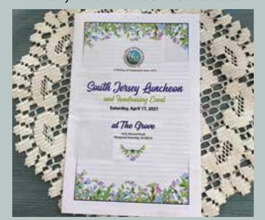
South Jersey Ministry Luncheon