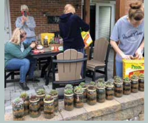
Making centerpieces for the South Jersey Ministry Luncheon and BASIS Breakfast.