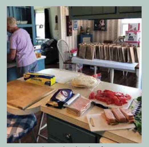
Preparing brown bag lunches for campers and staff in the Sheetz's kitchen