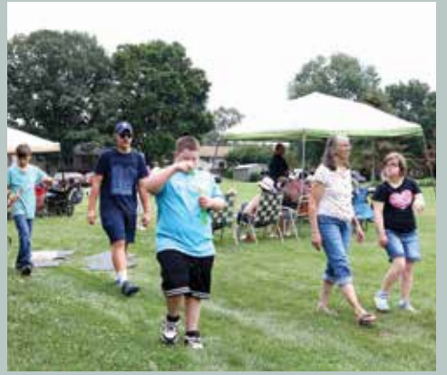
Disability Ministries Picnic