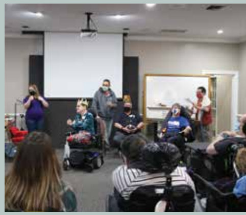
Bible Conference Retreat