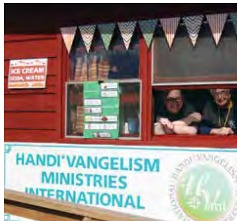
Eager to make ice cream sodas.