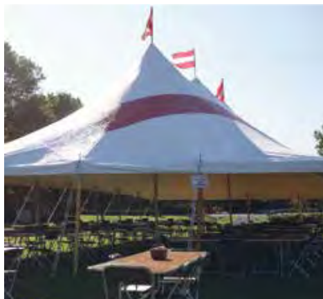
Waiting for our dinner guests.