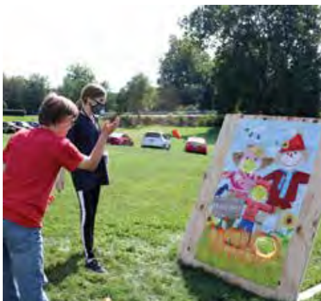
Fun fall games.