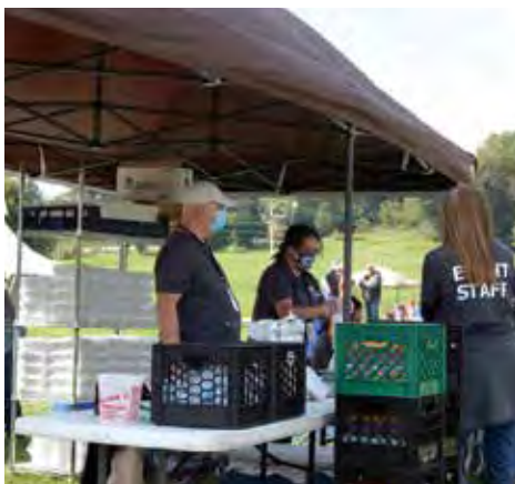
Serving team ready to go.