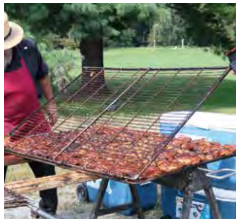
The main event.