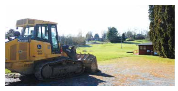
DELIVERY OF THE FIRST EXCAVATOR TO THE PROPERTY

In late October 2022, H*VMI had a Groundbreaking Celebration. We gave updates, praised the Lord and sang together in the bright sunshine on our property. Due to some time-consuming red tape in November, we didn't get machines on the property until December. However, through the month of December there was a flurry of activity! Entrances were dug in, silt socks laid down and the excavators were out marking the site for excavation. Prayers for weather, available building material and other needs were lifted up to the Lord daily as H*VMI worked with contractors to accomplish project goals. Our Step One, following the initial excavation, is construction of the H*VMI Office Building. It contains space enough for