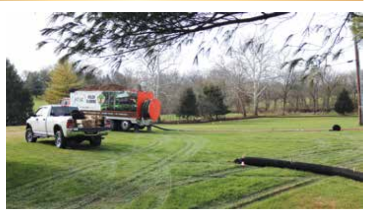
FILLING THE SILT SOCKS ALL OVER THE PROPERTY

our current office staff plus room for growth; and areas to host small ministry outreaches such as Bible clubs, support groups and training. Vacating our current office will free up tens of thousands of dollars in rental expenses annually. We look forward to moving into our new office ASAP!