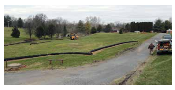
EASTERN SIDE OF THE SITE

When we pray over this building project, God often brings examples from His Word to mind. One of these is 1 Chronicles 29 when the temple was built in the time of David. Going back to the idea of gold again: In that time, the people were contributing to the temple building project by giving gold, silver and precious stones. God used His people's personal and sacrificial giving to provide the necessary materials to build His temple. H*VMI sent out our first fundraising mailer in December 2022. If you've seen it, you know we weren't asking for your gold! Nevertheless, the response has been "golden," and H*VMI has been so blessed by the outpouring of support. We are 100% confident in God's provision, but we do not want to assume that it will be on our timeline. If you haven't already been thinking and praying about this, I would ask you to please consider if God may be leading you to donate on a monthly basis or to give a one-time gift to assist H*VMI with this project. We have waited patiently for Him since He first laid the Ministry Center on the hearts of the H*VMI Board. He has always provided exactly what we need, when we needed it. Please continue to PRAY for H*VMI as we pursue the completion of this project and its funding. PRAISE for the opportunity to trust God anew each day, and PRAISE Him for all He has done.