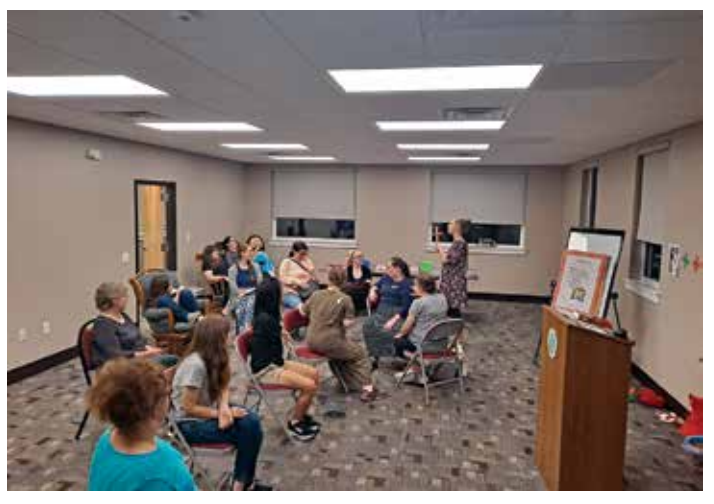
BIBLE CLUB HELD IN THE OFFICE CONFERENCE ROOM