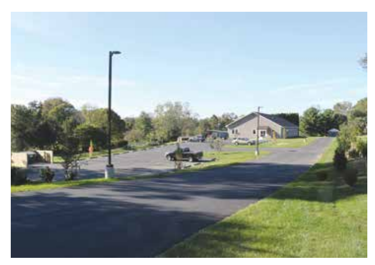
DRIVEWAY VIEW OF BUILDING