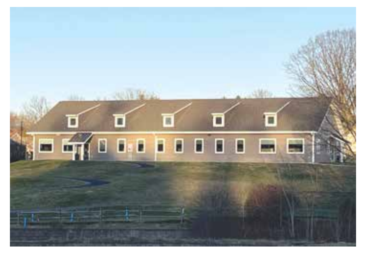
SIDE VIEW OF BUILDING