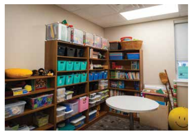
TEACHER PREP ROOM